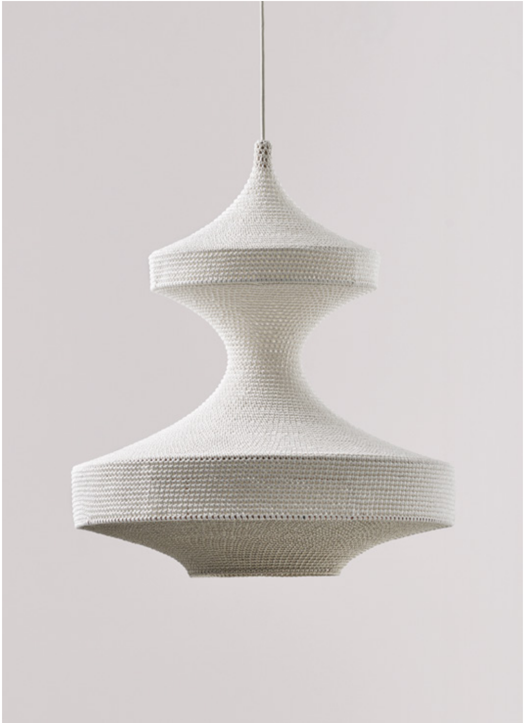
MONIKA, two tone finish in White and Putty