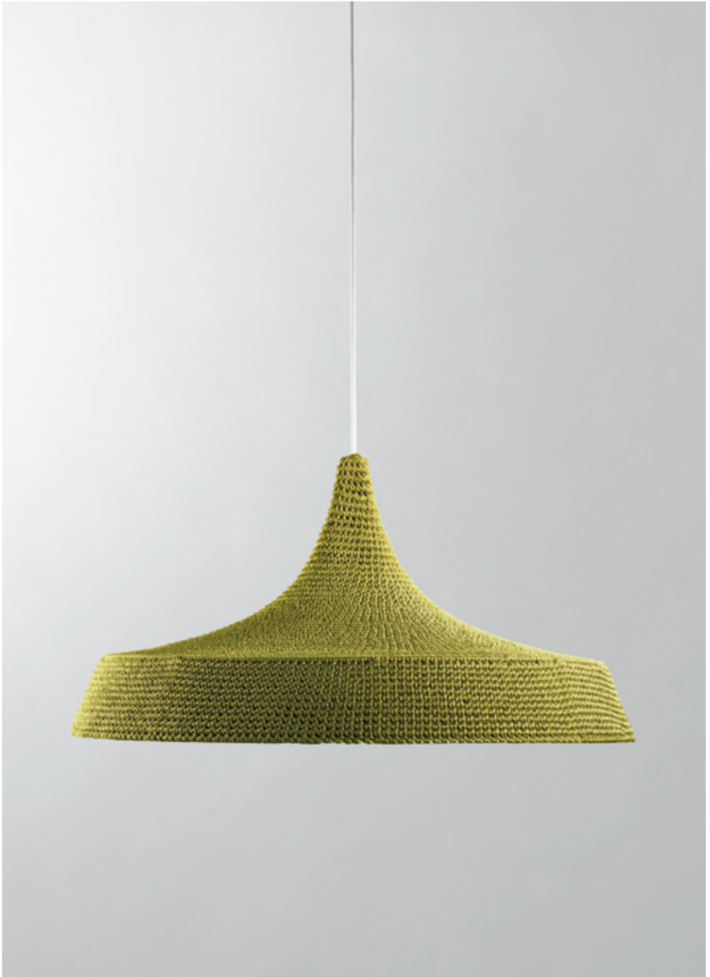
VEX, plain finish in Greengold